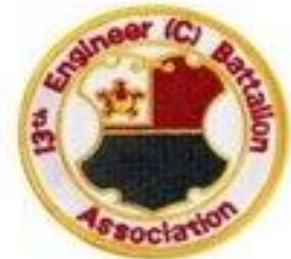
ASSOCIATION PATCH $3.00