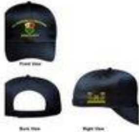
CAP – BLACK NEW STYLE $20.00